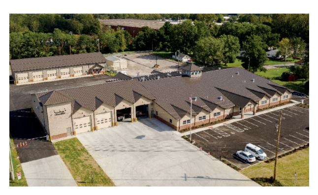
Roof color: Antique Brown