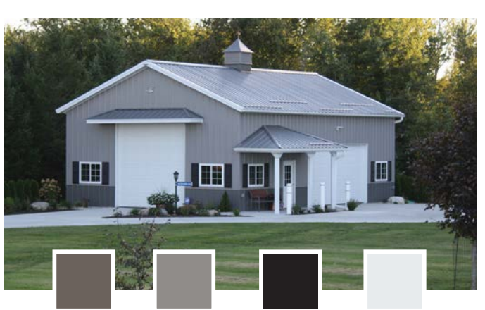
Quaker Gray Pewter Gray Black Shutters Snow White