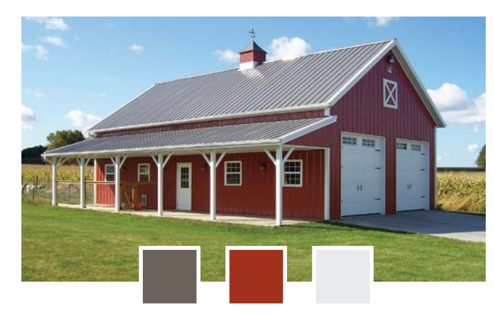
Quaker Gray Barn Red Snow White