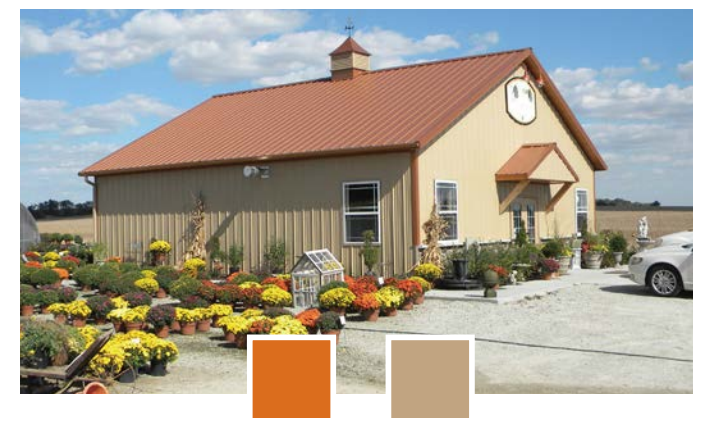
Metallic Copper Rawhide