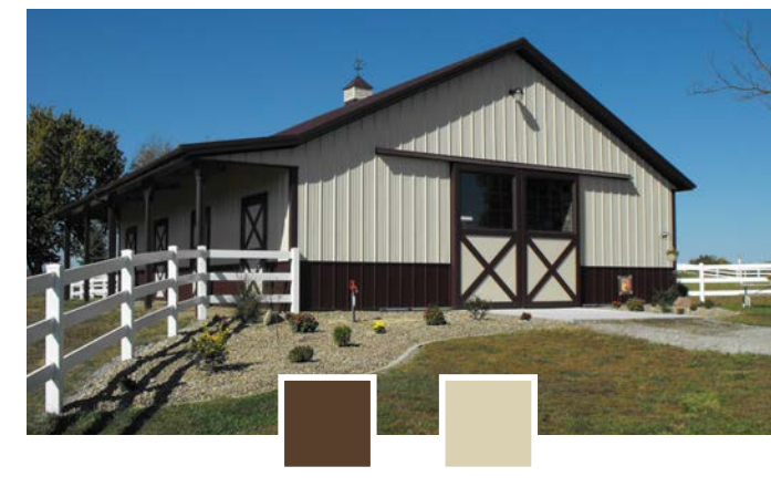
Earth Brown White Sand