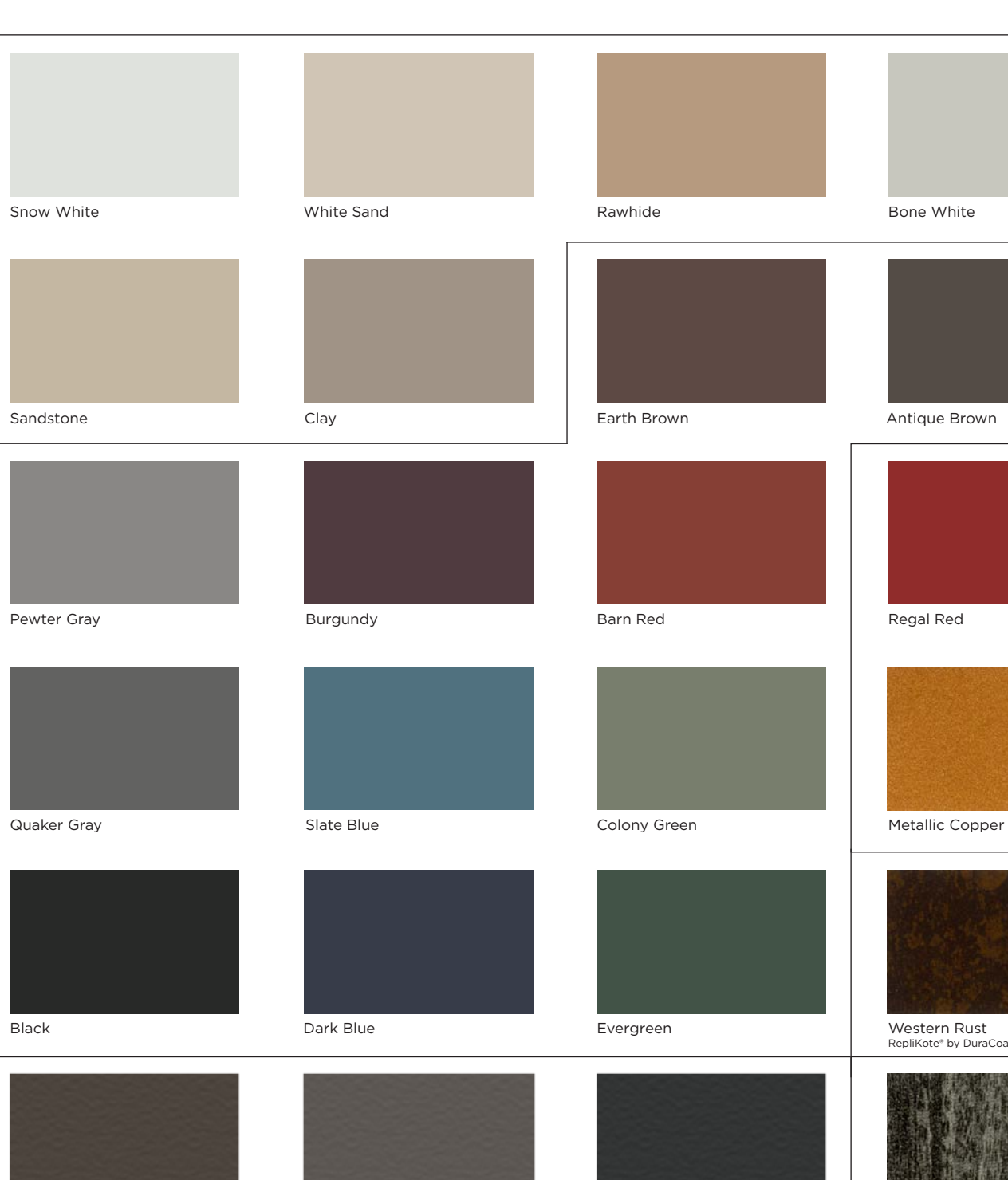
— AVAILABLE ON 28 GAUGE AZ50 UNI-RIB ONLY – Color variation may occur between Crinkle finish and standard Lester colors.